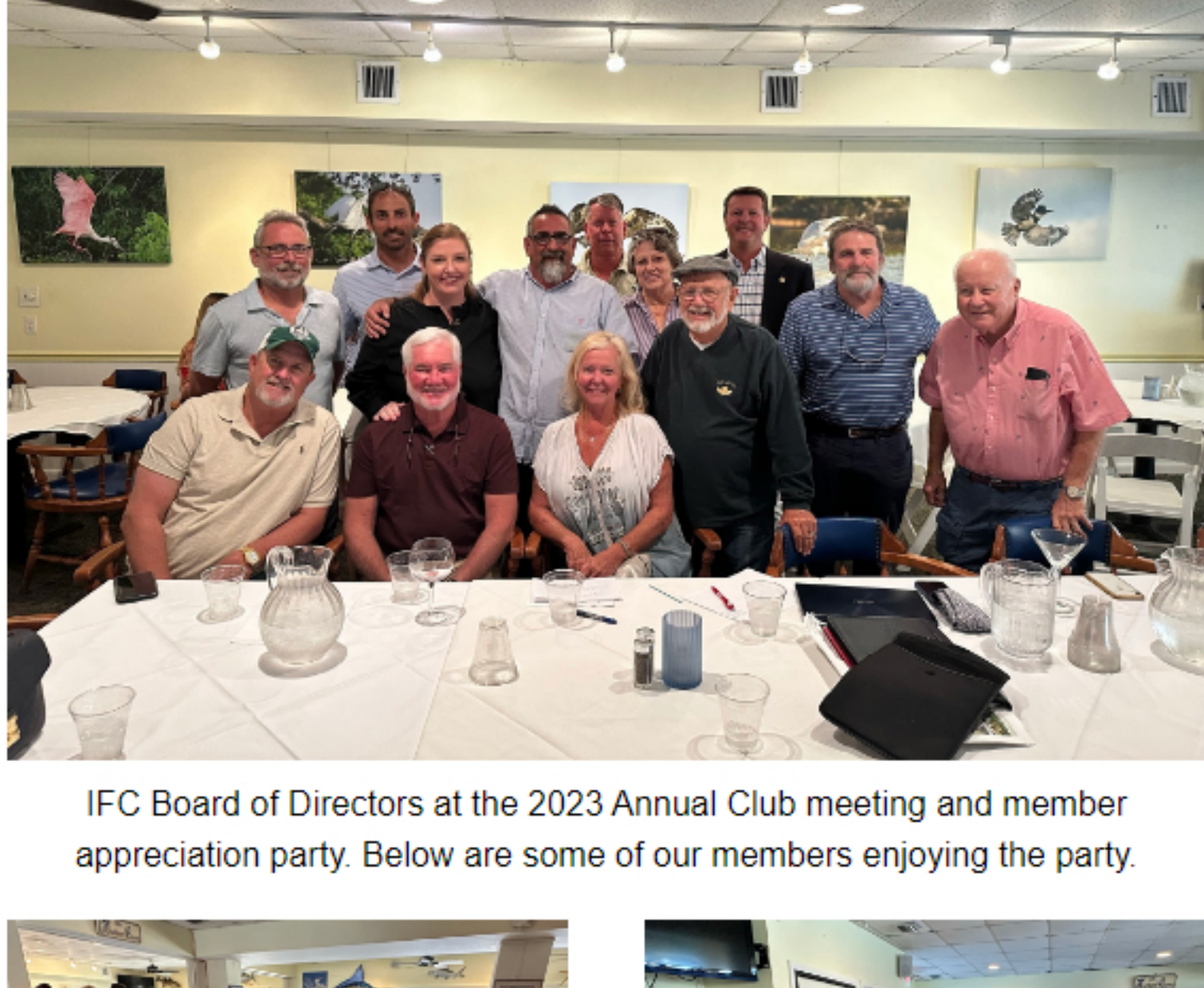
IFC Board of Directors at the 2023 Annual Club meeting and member appreciation party. Below are some of our members enjoying the party.